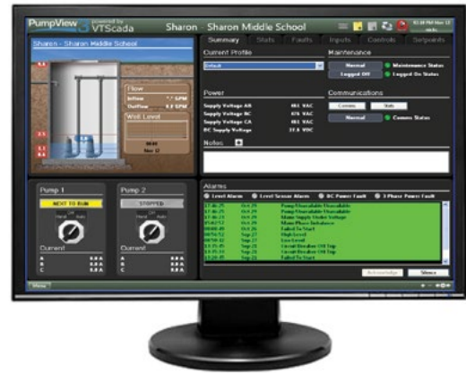
FB098 • Flygt PumpView3 Flyer • 12/2013 • US

Outsourcing noncore business processes has become standard practice for governments, utilities and corporations worldwide. Benefits include cost savings, improved quality of data, complete network knowledge, reduced site injury, increased energy consumption - not to mention the benefits of Flygt's 80+ years of industry experience!