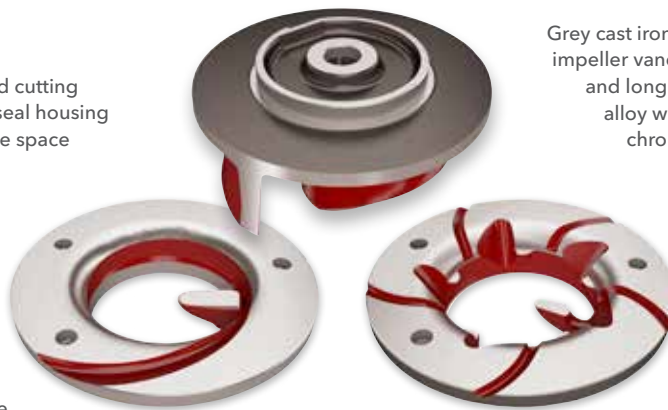
Hard-Iron impeller and insert ring including chopper version

Machined gap surfaces, created in high-precision manufacturing processes, provide tight tolerances and ensure high pumping performance.