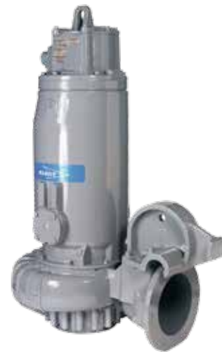
Flygt CP3356, 280-horsepower submersible pump

Xylem, Inc. 14125 South Bridge Circle Charlotte, NC 28273 Tel 704.409.9700 Fax 704.295.9080 855-XYL-H201 (855-995-4261) www.xyleminc.com