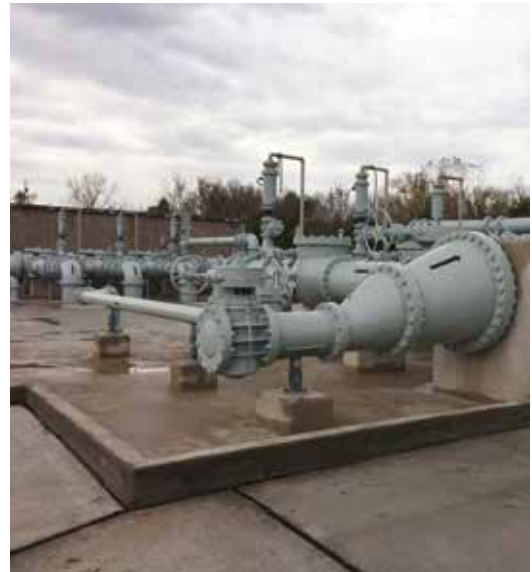
New lift station in Houston, TX includes six Flygt CP3356, 280-horsepower submersible pumps

In the end, the City of Houston, Klotz Associates and Hahn Equipment worked arm-in-arm to deliver a successful lift station for the city of Houston. The Sims Bayou project was designed and constructed in an environmentally responsible manner, and an increasing number of birds and wildlife can already be seen along completed segments of the bayou and at the stormwater detention basins.