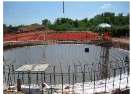
Construction of “Station in the Round” in Sims Bayou

The CFD study revealed problems with flow distribution at the approach to the proposed pumps, as several of the pumps would suffer from excessive swirl and uneven velocity distribution at the impeller eye.