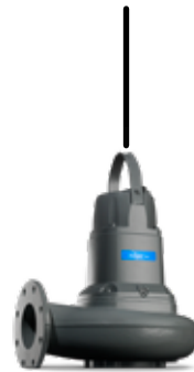
SYSTEM THAT CAN BE LOCALLY ADJUSTED

* Retrofit kit includes MultiSmart controller, DP gateways, surge protector, modem kit with antenna, power supply and battery